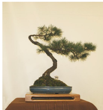
This month's Tokonoma